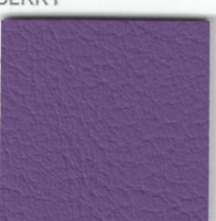
107-2118 ULTRA VIOLET